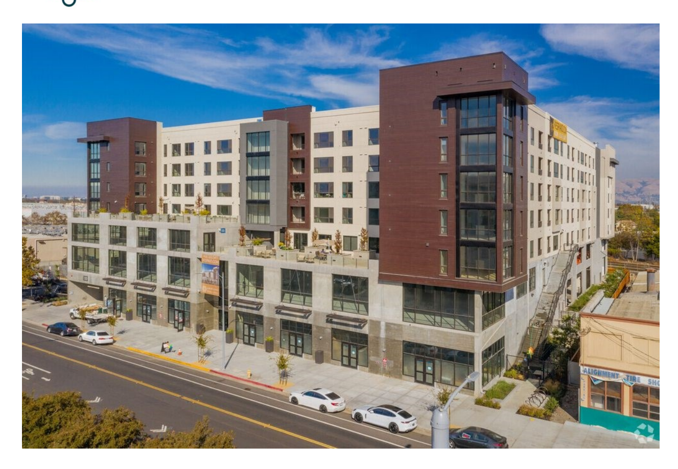
Vespaio 162-unit apartment complex with the 60 Stockton Avenue tire shop to the right (Caltrain tracks are visible in the background).